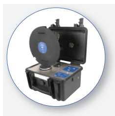
SV 111 Hand-Arm and Whole-Body Vibration Calibrator