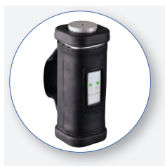
SV 110 Hand-Arm Vibration Calibrator