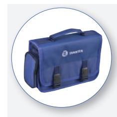
SA 47M Carrying Bag Fabric Material