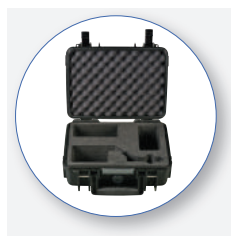
SA 76 Waterproof Carrying Case