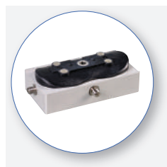
SA 105 Calibration Adapter to SV107