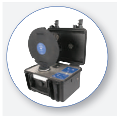
SV 111 Vibration Calibrator