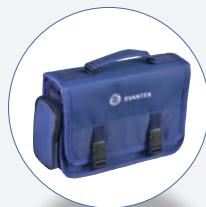
SA47M Carrying Bag Fabric Material