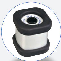
SV34 Class 2 Acoustic Calibrator 114 dB at 1 kHz